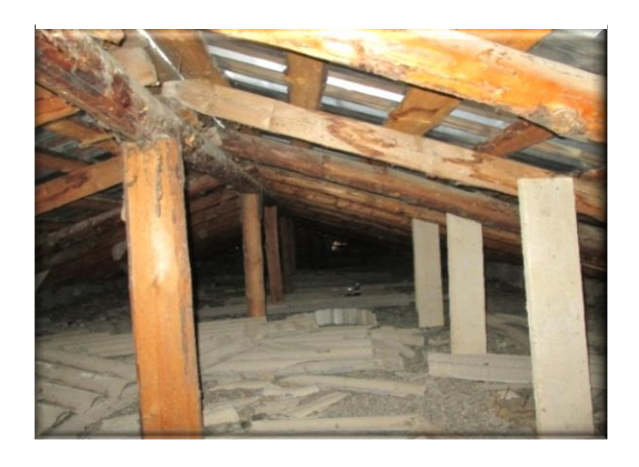
Figure 2. Current Status of the Building Piteched Roof with Construction Garbage instead of Insulation

Roof of the kindergarten is generally renovated previously but because of some mistakes in assembly process leakage of water from the roof is observed in winters. Thermal insulation of the roof is implemented by a 7cm slag which does not meet the normative requirements of local thermal insulation standards. Roof should be strengthening by adding additional wooden column supports.