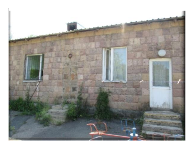
Figure 3. Building Fenestration Partially Consists of Worn Out Wooden Windows and Doors